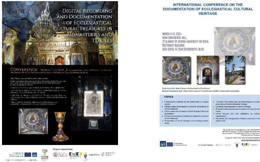
Figure 3: Poster and Flyer