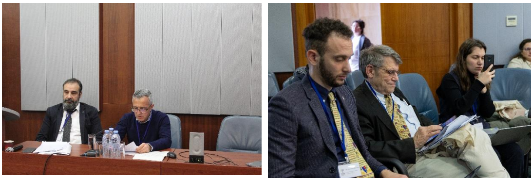
Figure 14: Prof. Theodor Enchev