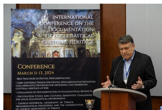
Figure 7: Rector Prof. Georgi Valchev