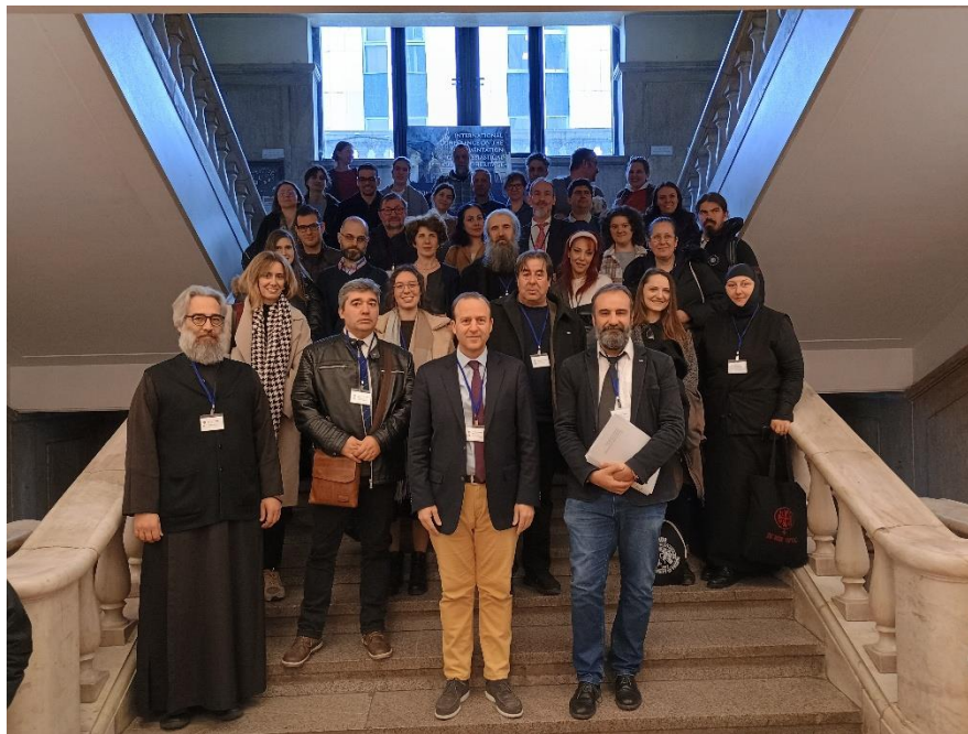
Figure 18: A group photography at the end of the working sessions