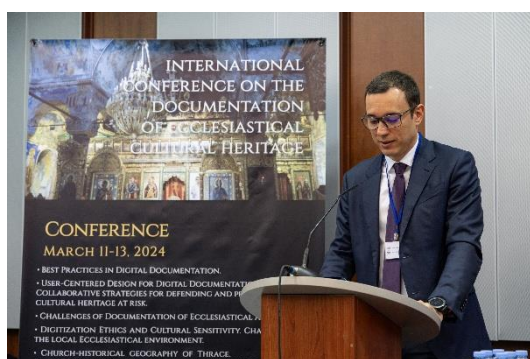
Figure 6: Mayor Vassil Terziev