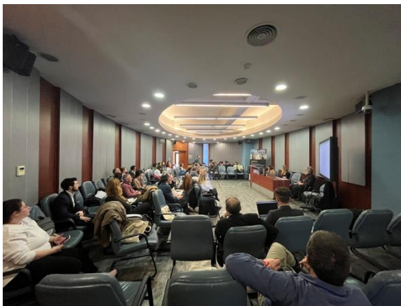
Figure 1: New Conference Hall during the 1 st day of the Conference

and ensure its safe operation during the three-day event. In the month leading up to the conference, the technical systems in the hall were tested by the university's dedicated engineer responsible for the event. Meanwhile, the Sofia team maintained constant communication with colleagues from Greece and Turkey regarding the requirements for the hall and equipment, ensuring that all invited keynote speakers could deliver their presentations at the conference without any obstacles. The hall is equipped with a high-tech setup for simultaneous interpretation, a video wall, an audio system, and other advanced facilities.