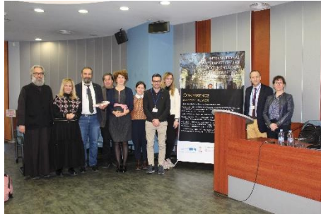
Figure 16: 2nd Transnational Meeting

The entire conference was recorded on video, which has been made available to colleagues for the dissemination of the event's results.