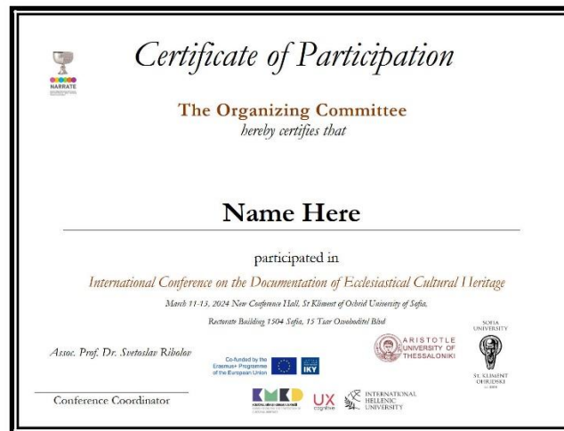
Figure 21: A sample of the individual certificates prepared for the participants.