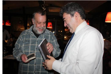
Figure 17: Social Dinner