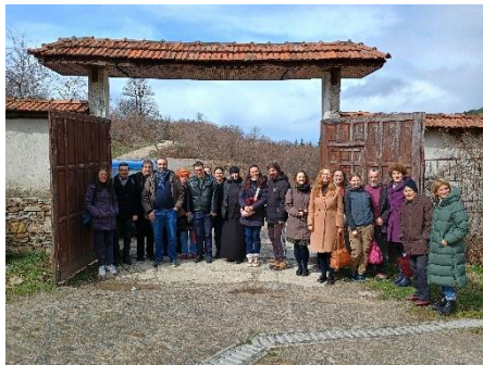
Figure 19: In the Monastery of German