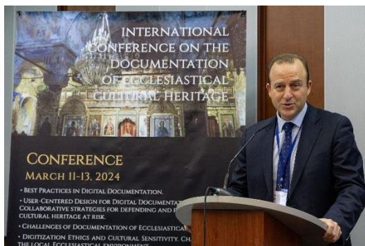
Figure 10: Prof. Efstratios Stylianidis