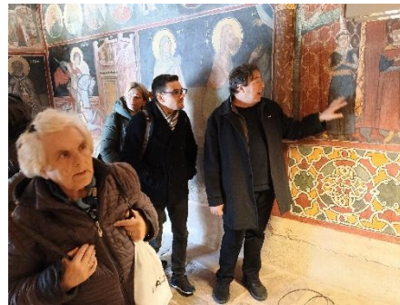
Figure 20: In the Monastery of Cremikovtsy

The entire conference can be followed through the exceptionally high-quality video recordings made during the conference sessions. Additionally, the event's website features a detailed collection of photographs, showcasing moments from the sessions as well as the visits to monasteries and churches on the third day of the conference. 6 These resources allow participants and those unable to attend to relive the experience and engage with the outcomes.